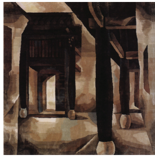
The Old Dwelling by Song Ke

SAN JOSE, Calif., October 21, 2008 – The San Jose Museum of Quilts & Textiles in partnership with the Fiber Arts Institute of the Academy of the Arts & Design at Tsinghua University in Beijing presents Changing Landscapes: Contemporary Chinese Fiber Art , February 3 – April 26, 2009. The opening reception, free with admission, is Sunday, February 8, 2:00-4:00pm.