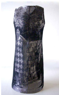
Wen-Ying Huang Dress