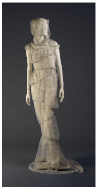
Noel Paloma-Lovinski Holding it In