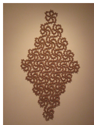
Arabesque by Sheila Klein

SAN JOSE, Calif., April 25, 2011 – Following on the well received 2008 exhibit, Beyond Knitting: Uncharted Stitches , the San Jose Museum of Quilts & Textiles' 2011 exhibit, Primary Structures , will further explore how innovative artists using simple linear elements in combination with unconventional materials can transform the stitch structures of knit and crochet into large scale and compelling art. With work ranging from the architectural to graphic abstractions, from pioneers and established artists as well as contemporary emerging artists, Primary Structures continues to showcase the emergence of sculptural art knitting as a 21st century medium of imaginative and cutting edge artistic innovation. The exhibition is on view May 17-August 7, 2011 with an opening reception Sunday, May 22 from 2-4pm.