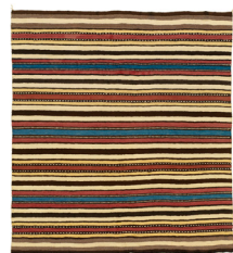
B. Hopi Blanket

Also on view will be Southwestern Banded Blankets: Three Cultures, One Horizon from the collection of Jean and Roger Moss. This is a unique exhibit and the first of its type to focus exclusively on banded blankets. These utilitarian and simply striped blankets showcase the rich cultural tradition of the Pueblo, the Navajo, and the Spanish Colonial Rio Grande blankets of the “Four Corners” area of the American Southwest. United by common elements of stripes and indigo coloration these blankets are elegant in their design composition, sophisticated balance and amazing variety.