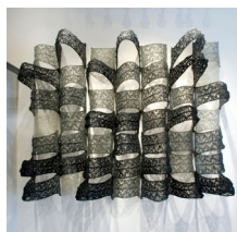
Black by Yvette Kaiser Smith

Included in this exhibit are four pieces by Mary Walker Phillips , known for her seminal work in changing public perception of knitting as art. Her work provides an important thread in paving the way for contemporary knit artists like those included in Beyond Knitting and Primary Structures who continue to stretch the medium.