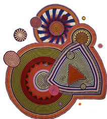
Trilogy by Xenobia Bailey

SAN JOSE, Calif., April 25, 2011 – Following on the well received 2008 exhibit, Beyond Knitting: Uncharted Stitches , the San Jose Museum of Quilts & Textiles' 2011 exhibit, Primary Structures , will further explore how innovative artists using simple linear elements in combination with unconventional materials can transform the stitch structures of knit and crochet into large scale and compelling art. With work ranging from the architectural to graphic abstractions, from pioneers and established artists as well as contemporary emerging artists, Primary Structures continues to showcase the emergence of sculptural art knitting as a 21st century medium of imaginative and cutting edge artistic innovation. The exhibition is on view May 17-August 7, 2011 with an opening reception Sunday, May 22 from 2-4pm.