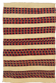
N. Navajo Blanket