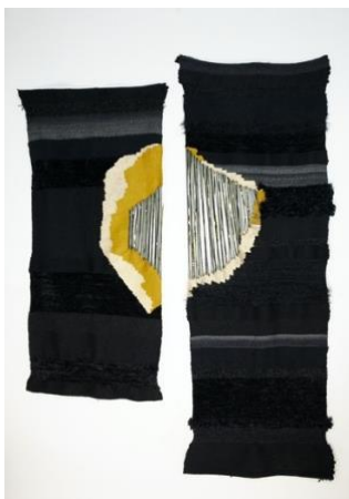
dani lopez Tryin' to hold it together , 2022 Handwoven cotton, novelty yarn, and metallic tinsel foil fringe 73 in x 50 inches