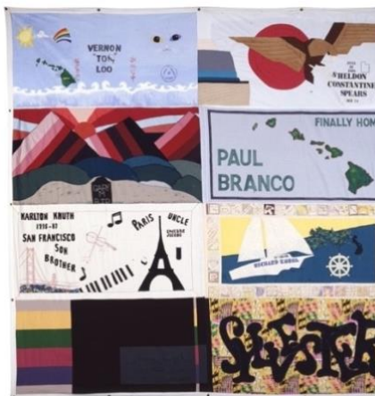
AIDS Memorial Quilt Block 1172 Cloth, thread 120x120 inches Courtesy of the National AIDS Memorial

Featuring more than three dozen works created as early as 1973 and as recent as 2023, the exhibition spans five decades. Many pieces are fully executed through thread-based processes such as embroidery, knitting, quilting, and weaving, while others interact with animation, clay, light, metal, and photography and expand traditional mediums like painting and sculpture.