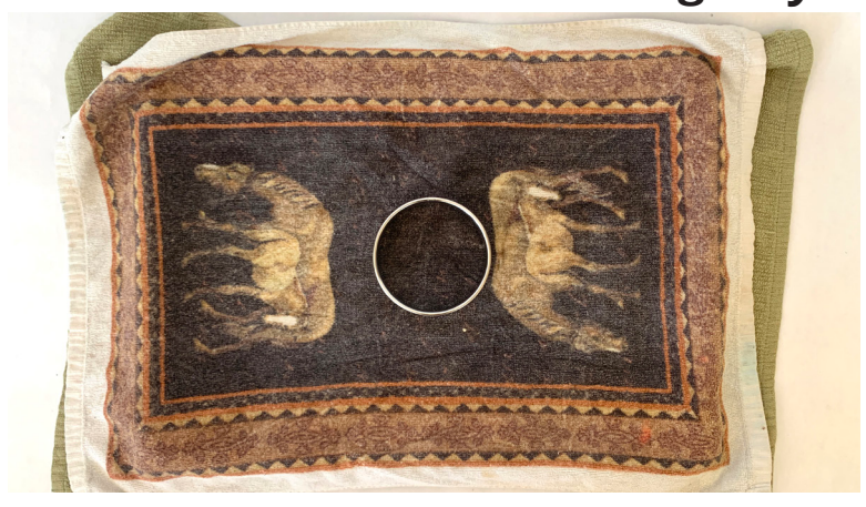
Cookie cutters and a baking tray