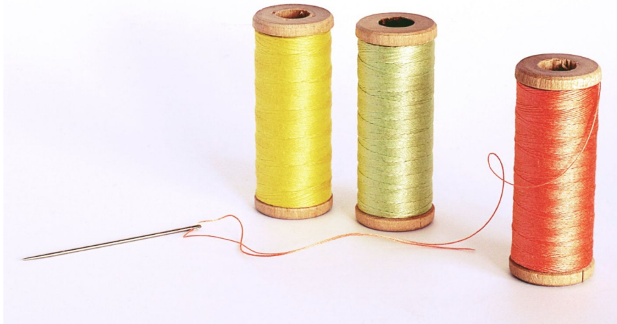
Image Description: embroidery needle and three assorted color sewing threads.